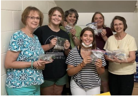
Mt. Hebron UMCW