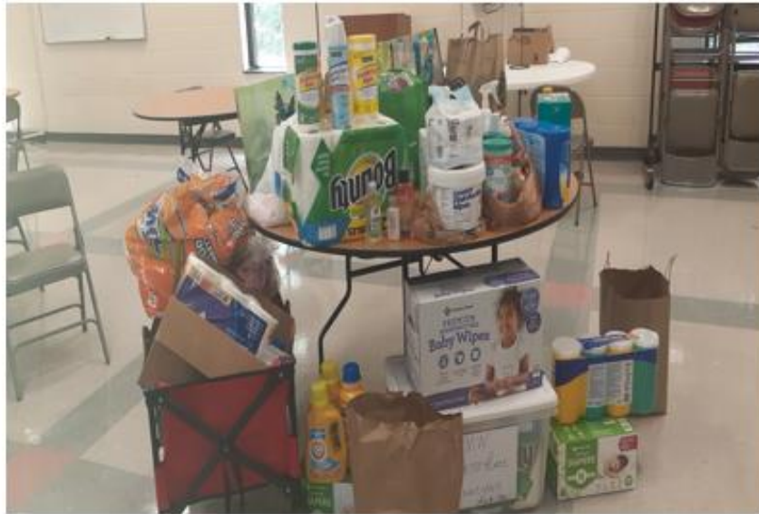
Francis Burns UMC donations to Palmetto Place