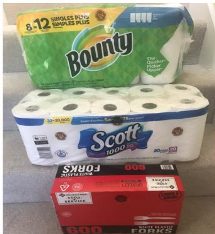
I Dequincey Newman donations to Palmetto Place