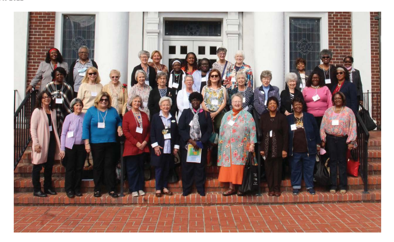
District Members in Attendance at SC Conference Annual Meeting