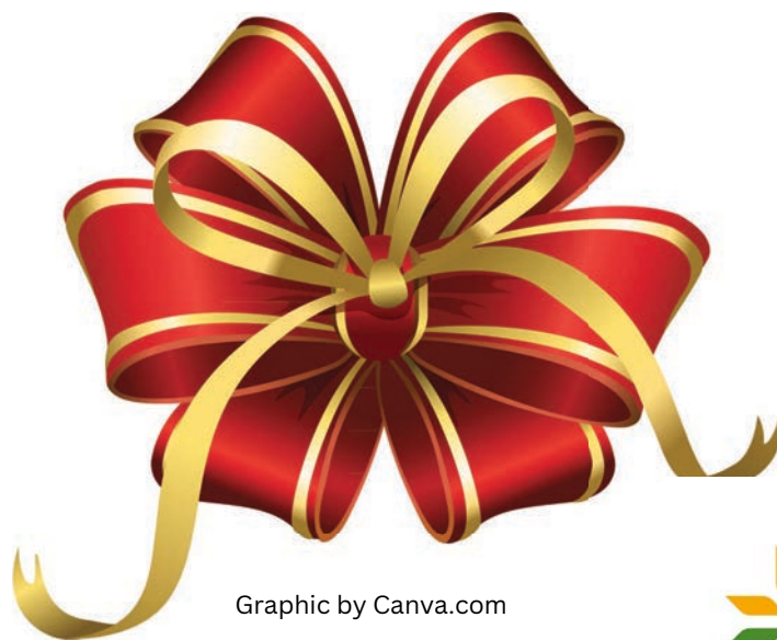
Graphic by Canva.com