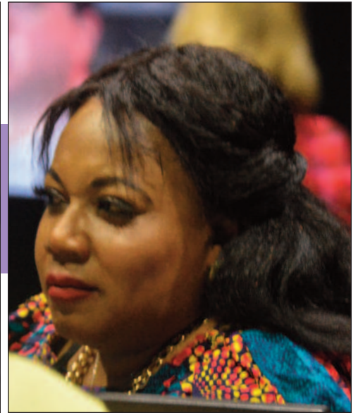
Attendees listens intently during the SC UMC Annual Conference in Greenville, SC