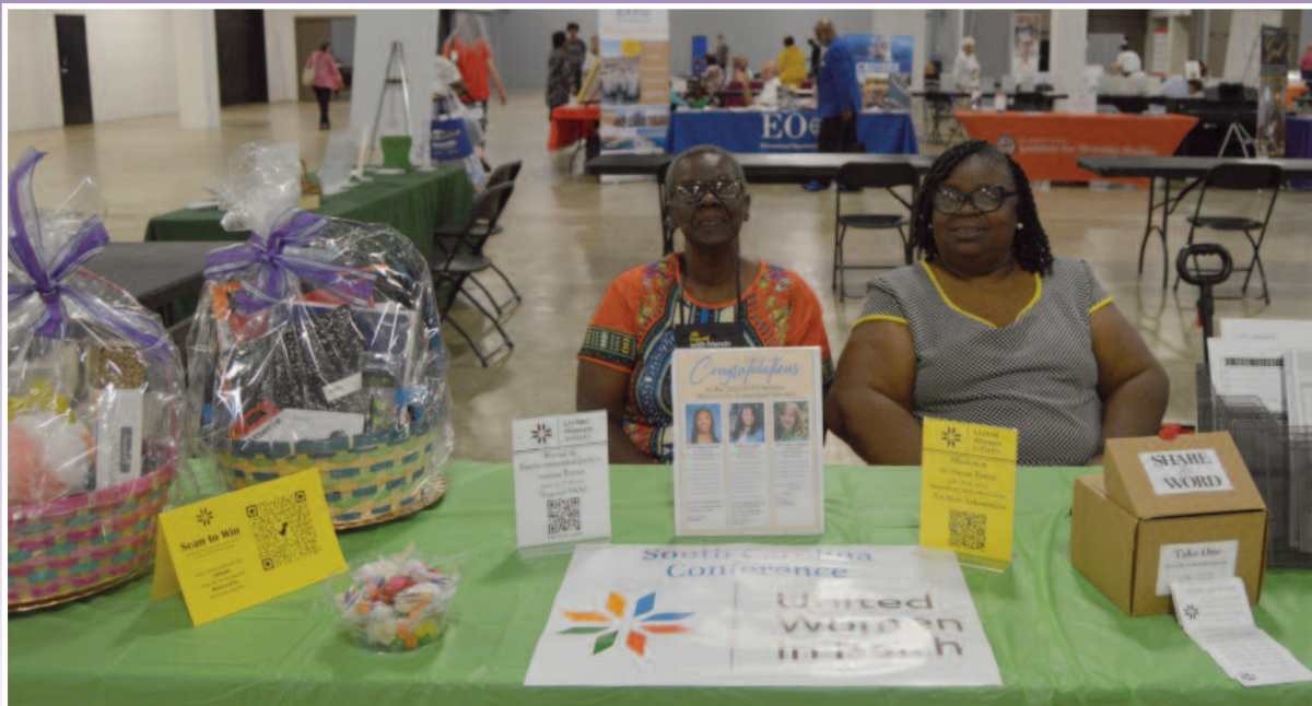
UWF display two sample baskets that were given away during the SC UMC Conference