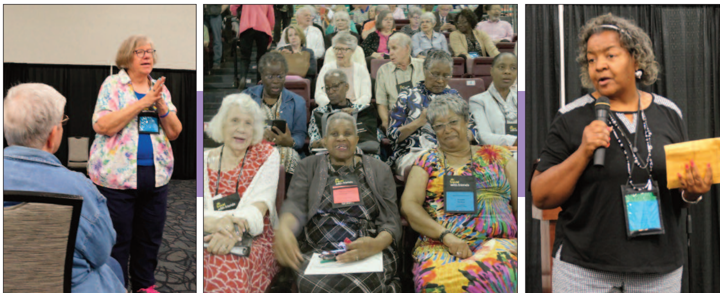
United Women in Faith engaged in the events of the SC Annual Conference