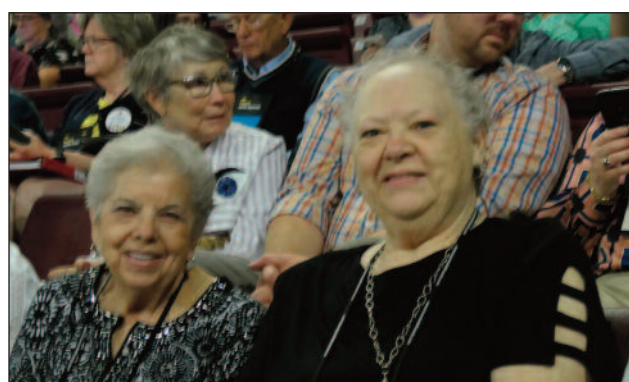
United Women in Faith in attendance at the SCCUMC Annual Conference