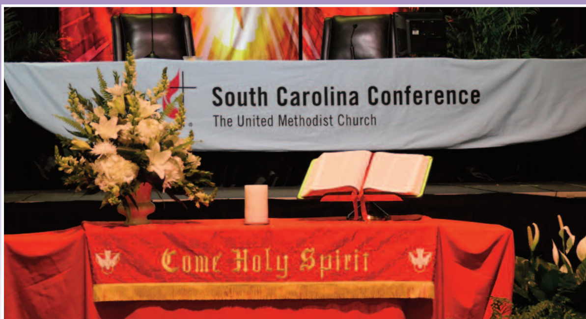
A quiet moment before the next session at the SC United Methodist Annual Conference in June