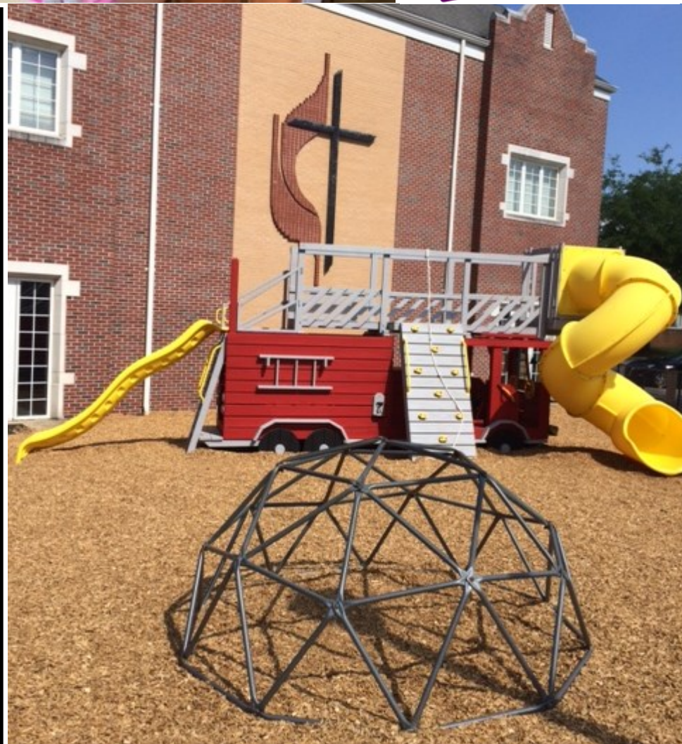
We couldn't help but notice this firetruck playground at Main Street UMC when visiting for the May Executive Committee meeting. What a beautiful display of the Cross and Flame in the background!