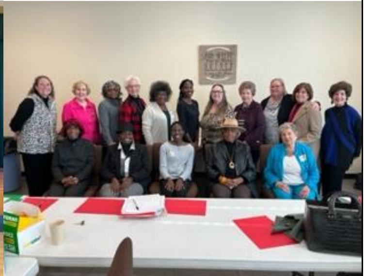
Columbia District Executives