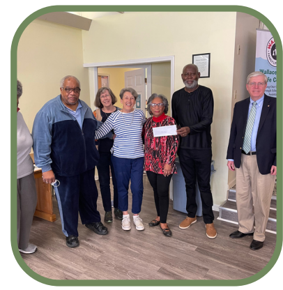
Donations for Playground equipment