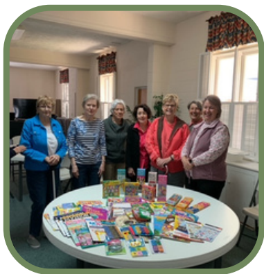
Latta United Methodist Donations