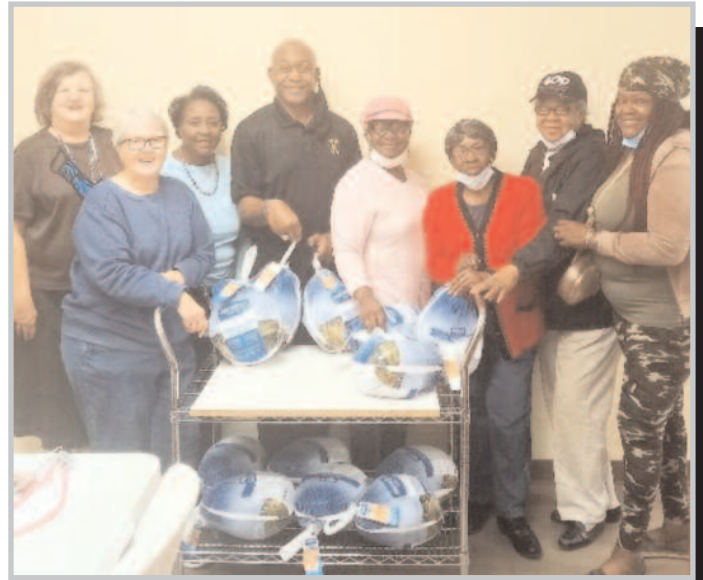
UMW Mission work is never done - Turkeys are distributed during the Thanksgiving holiday

“We are not meeting in person but we are meeting virtually”, One young lady said about her Unit