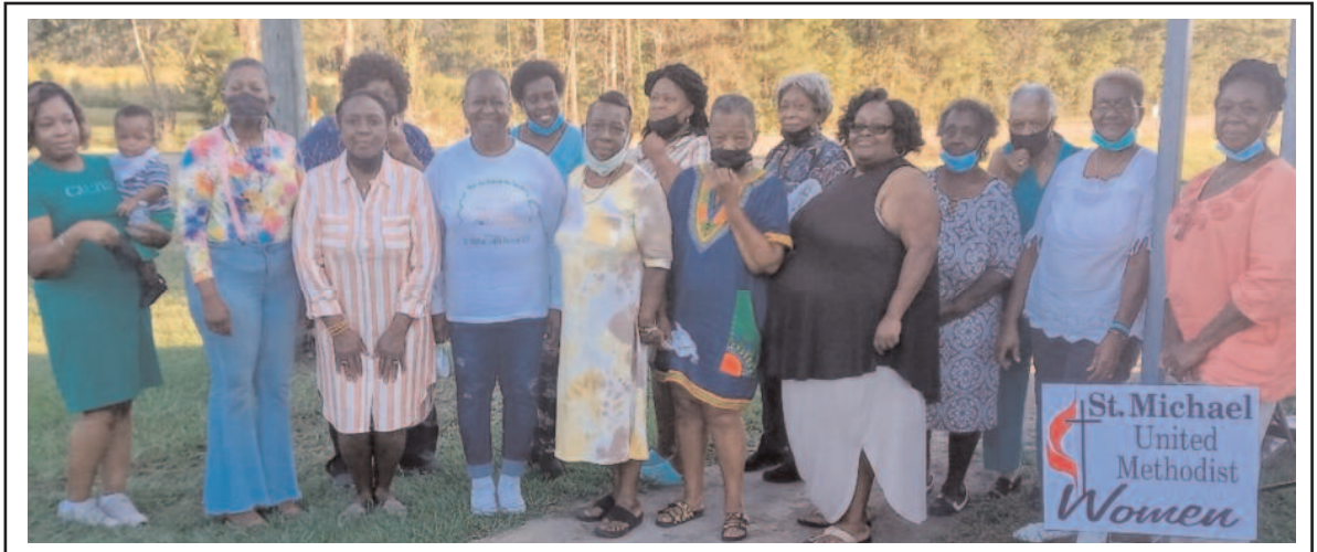
St. Michael UMW paused for moment from their mission project to gather for a picture