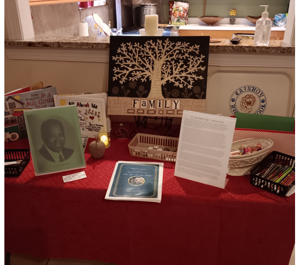
The Ladies of Stewart Chapel ~ Tribute to Black History Month