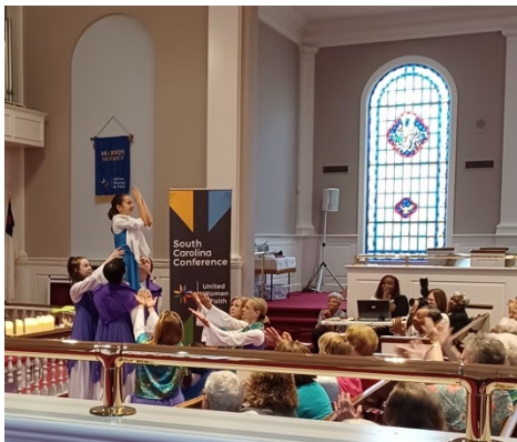
Interpretive Dancers -Socastee UMC Myrtle Beach