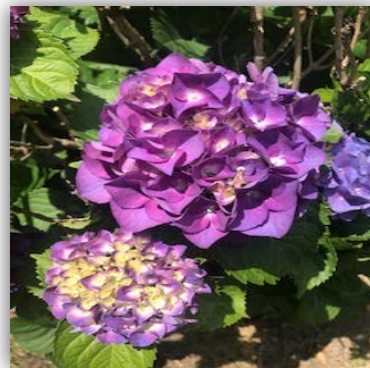
HYDRANGEA FROM OUR FLOWER GARDEN!!!