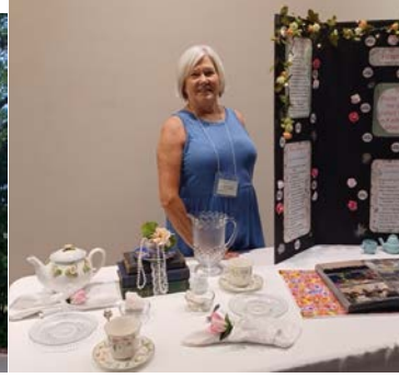
UW Faith-, Trinity, Aiken, Tea Project Mission