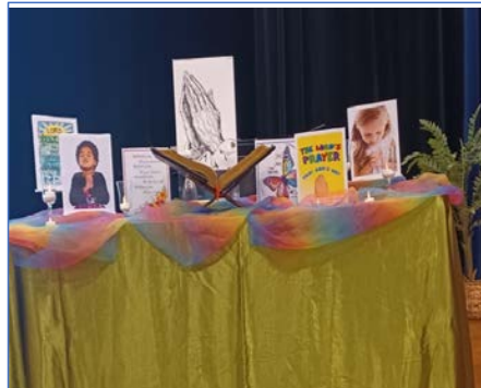
the Lord's Prayer Display