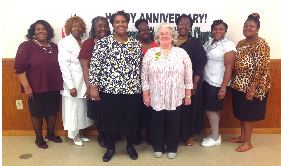
New Covenant UMW and SCCUMW President