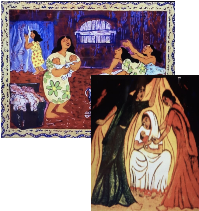
Artist rendition of Shiphrah and Puah