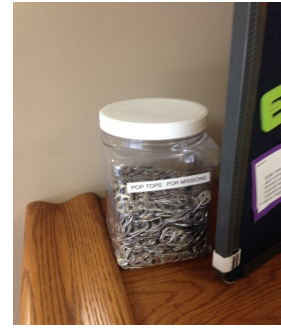
Collecting stamps for the Marion Mission and tabs Ronald McDonald House respectively

Congratulations to the 2020 Mission Today Units as announced at the Anderson District UMW 48th Annual Meeting