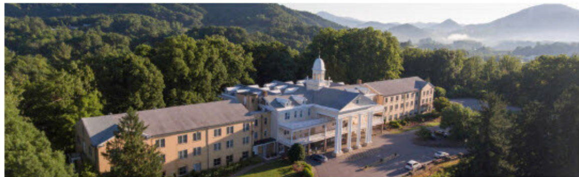
The Lambuth Inn