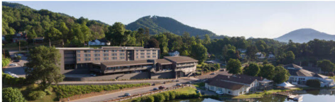
The Terrace Hotel

Package Rates are inclusive of taxes and 8% gratuities for meal serving staff.